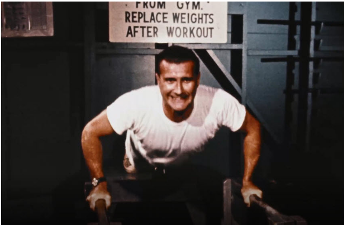
Manned Spaceflight Center - Curriculum for Space Flight Astros Physical Fitness in Ellington Gym, 5/28/1964, National Archives Identifier: 70175124

This incredible series of films includes footage of rigorous training exercises, mock run-throughs, launches, parachute and spacecraft recovery, and other astronaut activities, all detailing the meticulous steps involved in mission preparation and space exploration.