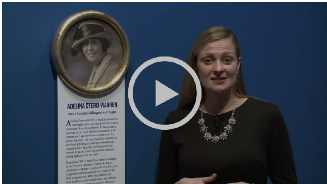
"Rightfully Hers" Exhibit Tour at the National Archives

Questions or comments? Email us at catalog@nara.gov .